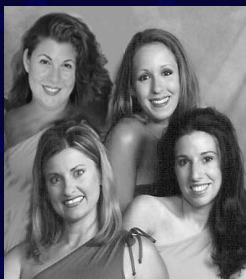
The Glory Girls